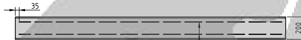
ELEVATION VIEW SCALE 1:20